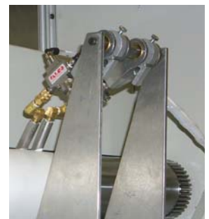
Enclosed Seam Paste Option