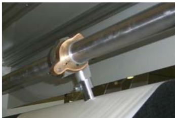
Thumb Tab Option